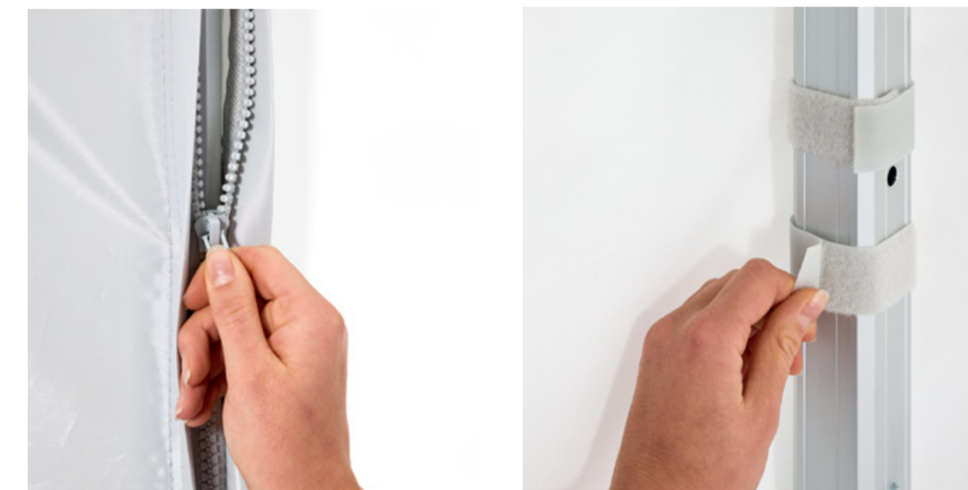
Zipper with PVC reinforcement at the bottom edge